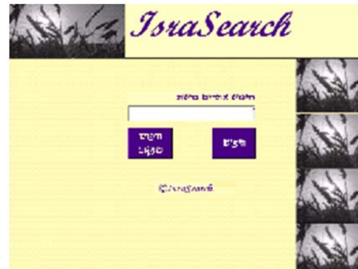
Figure 1. The six IsraSearch interface designs

on a 5 point Likert scale, from “very unattractive” (1) to “very beautiful” (5). Based on these ratings, we chose six designs for the main experiment, of which two were rated as highly aesthetic, two as low in terms of aesthetics, and the remaining two received medium ratings. In Figure 1, we present the six experimental designs arranged in three rows based on their aesthetic ascription in the pilot: low, medium and high, respectively.